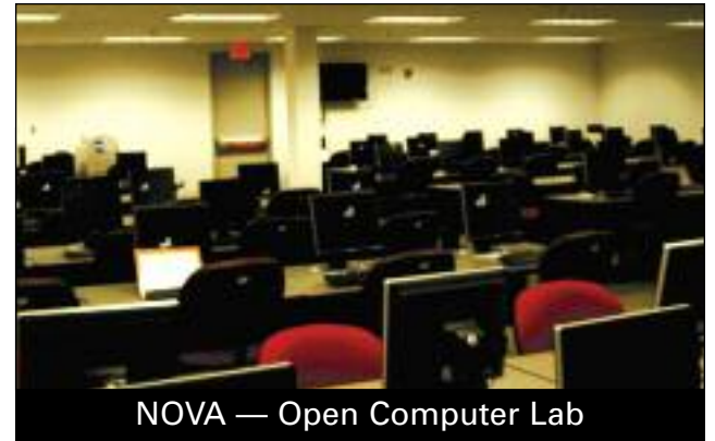
NOVA — Open Computer Lab