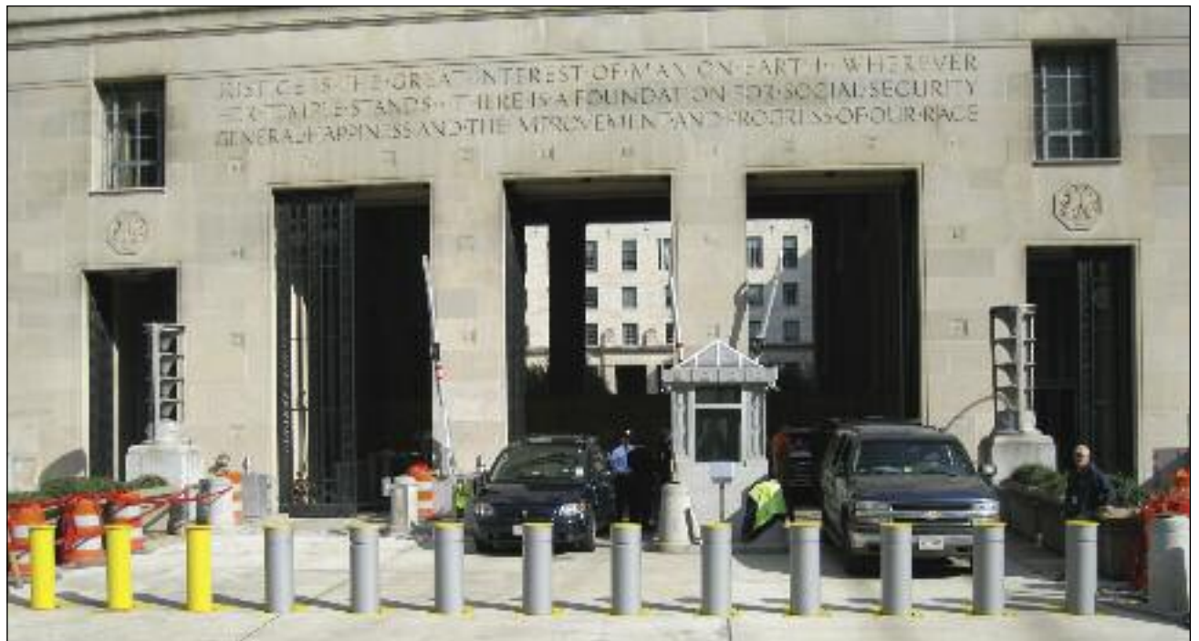
U.S. Department of Justice — Hydraulic Retractable Aluminum Clad Steel Bollards