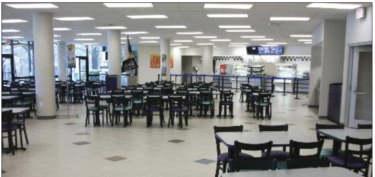
ALMC Food Concept Renovation — Fort Lee, VA

an existing 2,909 single story wood frame building with approximately 500 square feet of renovations to the existing building including expanded restrooms.