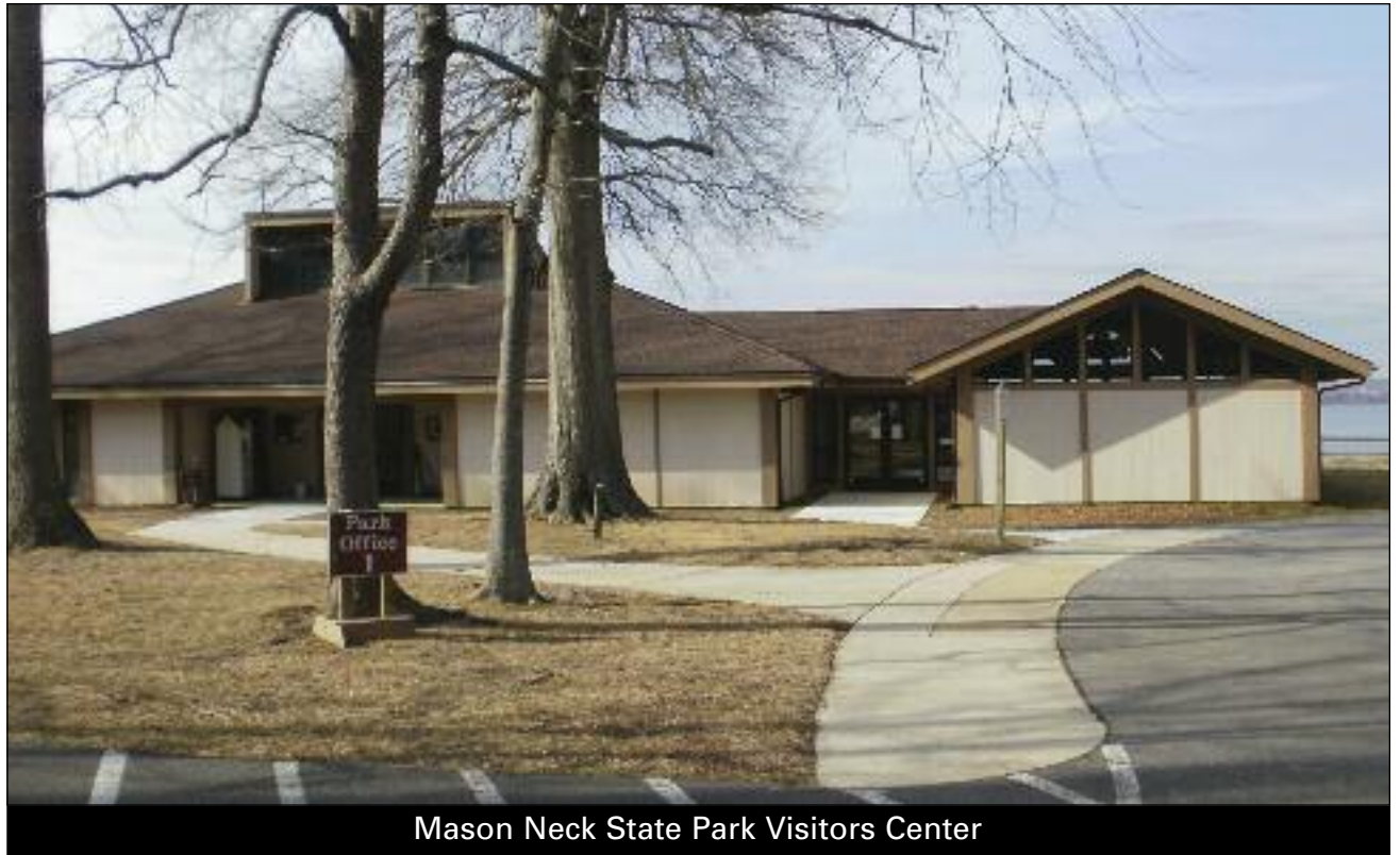
Mason Neck State Park Visitors Center