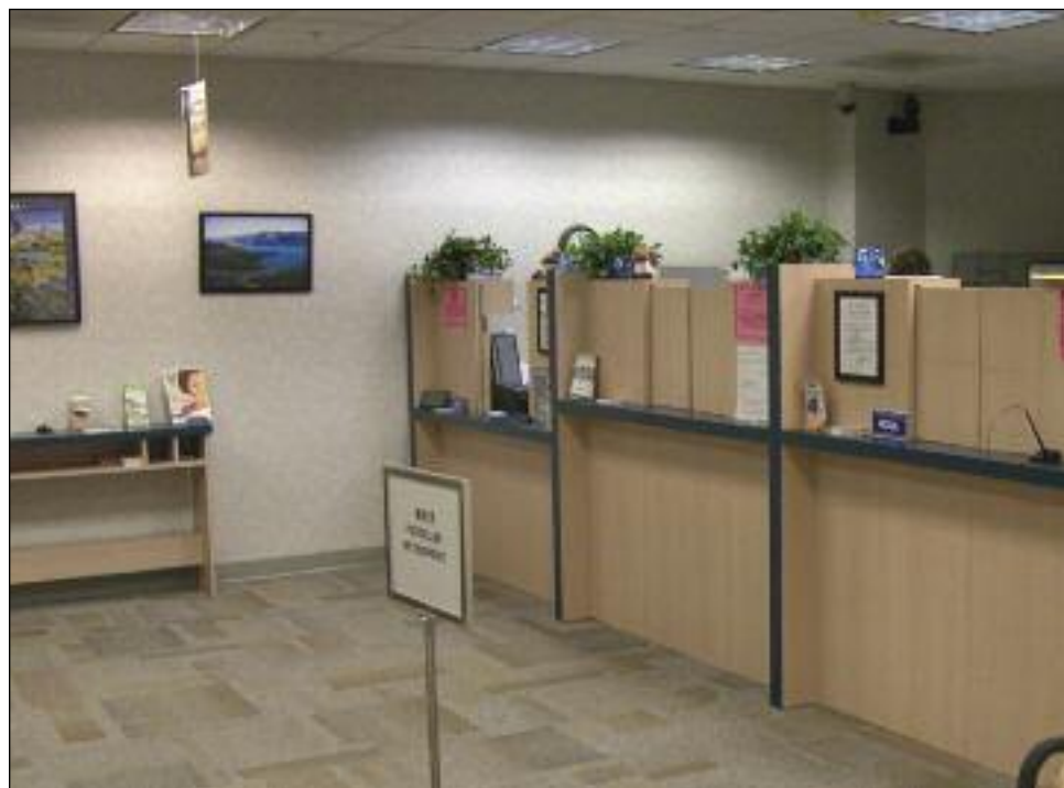
D.O.I. Federal Credit Union